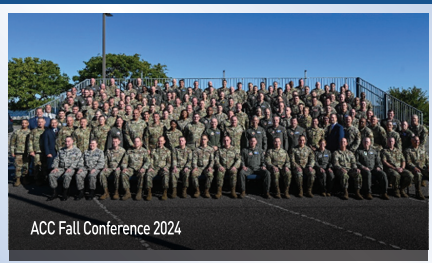
ACC Fall Conference 2024